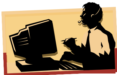
24 Hour Dial In Access